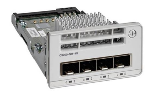
Figure 2. Cisco Catalyst 9200 Series Switch network modules